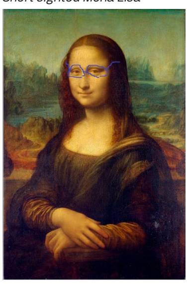
Figure 3 Short sighted Mona Lisa

Note. Adapted from Mona Lisa, by L. Da Vinci, c.1503-1517, Wikipedia (https://en.wikipedia.org/wiki/Mona_Lisa). In the Public Domain.