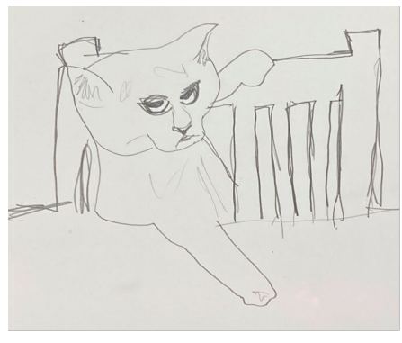
Figure 2 Marlon at the dinner table

My first attempts at drawing a cat that looked like my own were unsuccessful (see Figures 2 & 3)