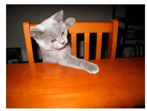
Figure 3 Actual picture of Marlon