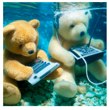
Figure 1 [Teddy bears working on new Al research underwater with 1990s technology]