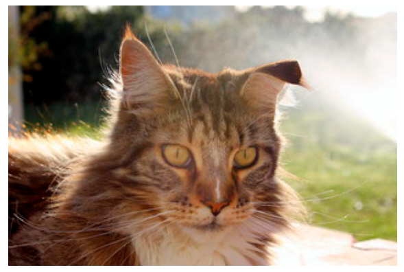
Figure 1 Cat with a floppy ear