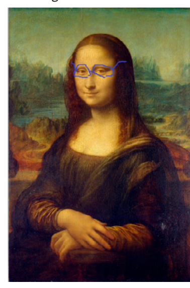
Figure 3 Short sighted Mona Lisa

Note. Adapted from Mona Lisa, by L. Da Vinci, c.1503-1517, Wikipedia (https://en.wikipedia.org/wiki/Mona_Lisa). In the Public Domain.